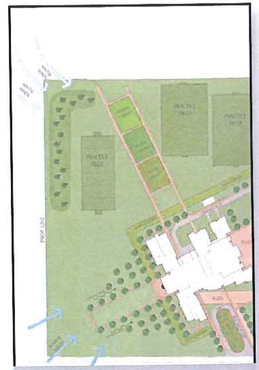
Wesclin Site Plan